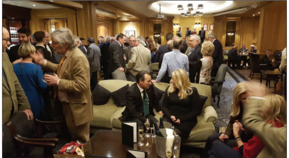
After lunch, Members and guests retired to the Long Bar downstairs.

I think that summarises very well how we both feel. SO now to the Arbutnot Spirit of the Season Award.